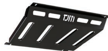
SUMP GUARD (077SBSUM50Q)