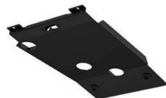
TRANSMISSION GUARD (077SBTRA50Q)

For your nearest retailer contact 07 3865 9999 | www.tjm.com.au