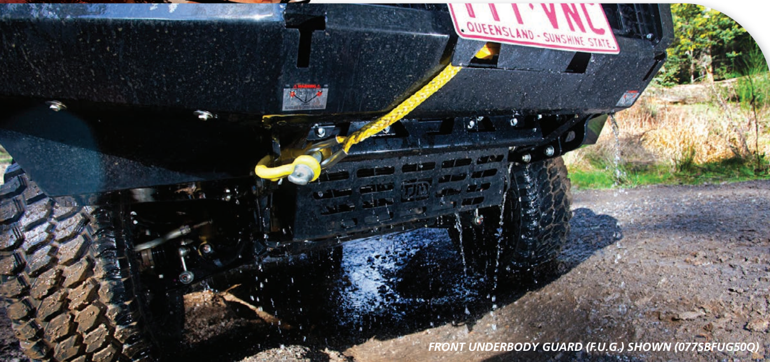
FRONT UNDERBODY GUARD (F.U.G.) SHOWN (077SBFUG50Q)