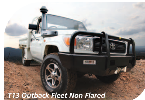
T13 Outback Fleet Non Flared