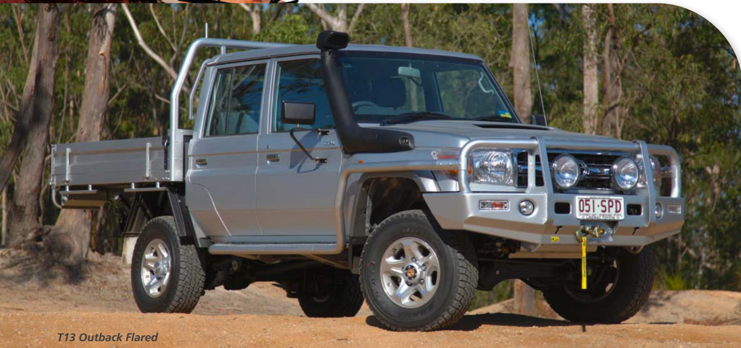
T13 Outback Flared