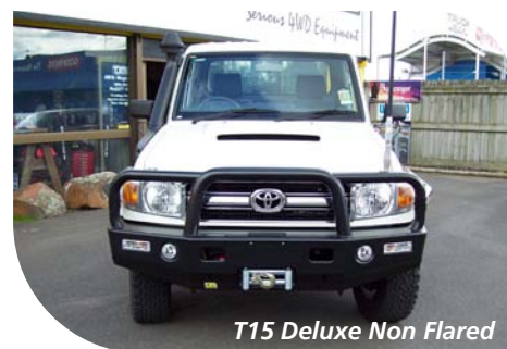
T15 Deluxe Non Flared

TJM EQUIPPED ON AND OFF ROAD. WORK OR PLAY.